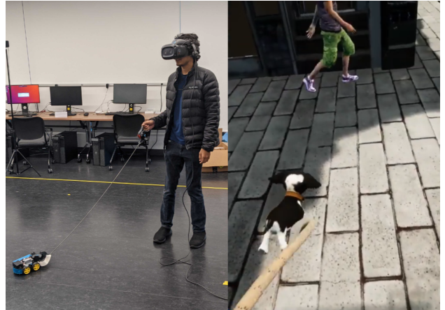
Fig. 1. An image of a user in the physical environment (left) and virtual environment (right) in our implementation of active haptic guidance. The user is tethered to a robot in the physical environment and to a virtual dog companion in the virtual environment. The robot provides haptic feedback to the user according to the virtual companion’s movements, which improves the user’s sense of presence in the virtual world and encourages the user to avoid the boundaries of the virtual reality system’s tracked space.

In this paper, we introduce the possibility of using robots to enhance the virtual experience through haptic feedback. Specifically, we use robots to guide the user as they navigate through a VE, and reconfigure and virtually expand the PE to align with the VE; we achieve this through manual haptic feedback that directs the user’s locomotion behavior in the VE, thereby making the virtual experience more immersive and safer. To this end, we introduce the concept of active haptic guidance , which describes the problem of reconfiguring one or multiple robots in the PE in real time such that they provide haptic feedback to guide the user and influence their actions and motion in the VE, with the ultimate goal of improving the user’s safety or level of immersion in MR. One major challenge with robots for active haptic feedback in MR is that the physical robots and their virtual counterparts must be co-located relative to the user , in order to provide the correct haptic feedback that aligns with the virtual counterpart. This problem can be exacerbated when the environments/interactions are dynamic (i.e. the physical and virtual haptic proxy must move synchronously) or when there is a decoupling between the user’s physical and virtual locations (as is common with some VR interaction techniques like redirected walking [24]).